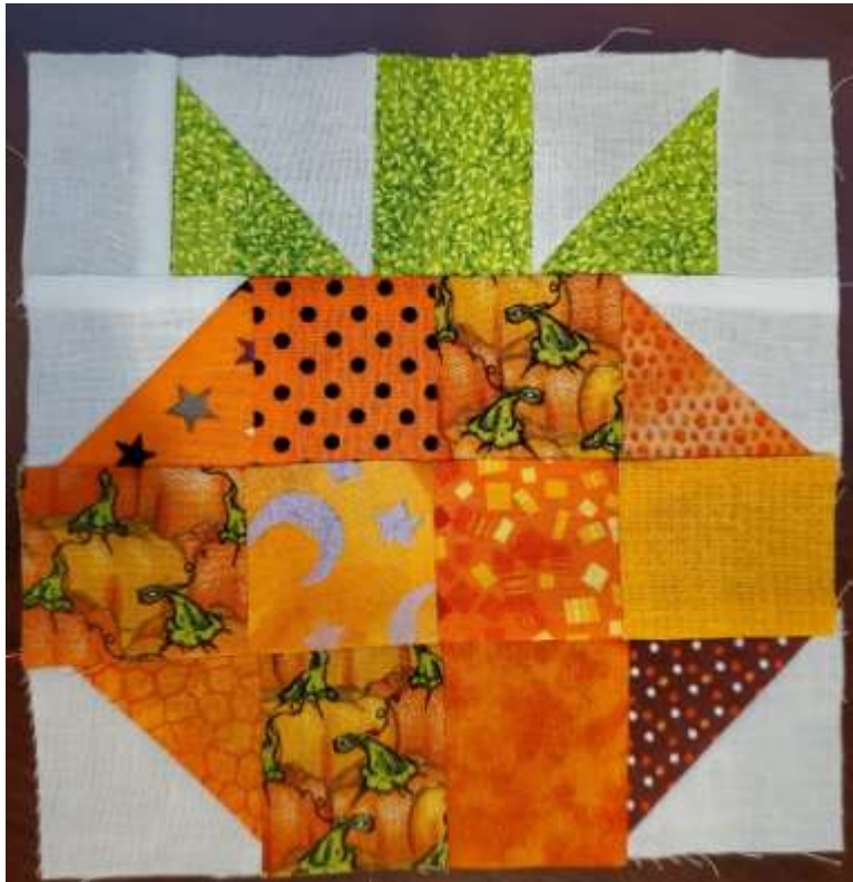
(Thank you Tracy Smith for trying the 6" pattern)

For 12" block go to https://www.simplesimonandco.com/2015/10/pumpkin-quilt-block.html